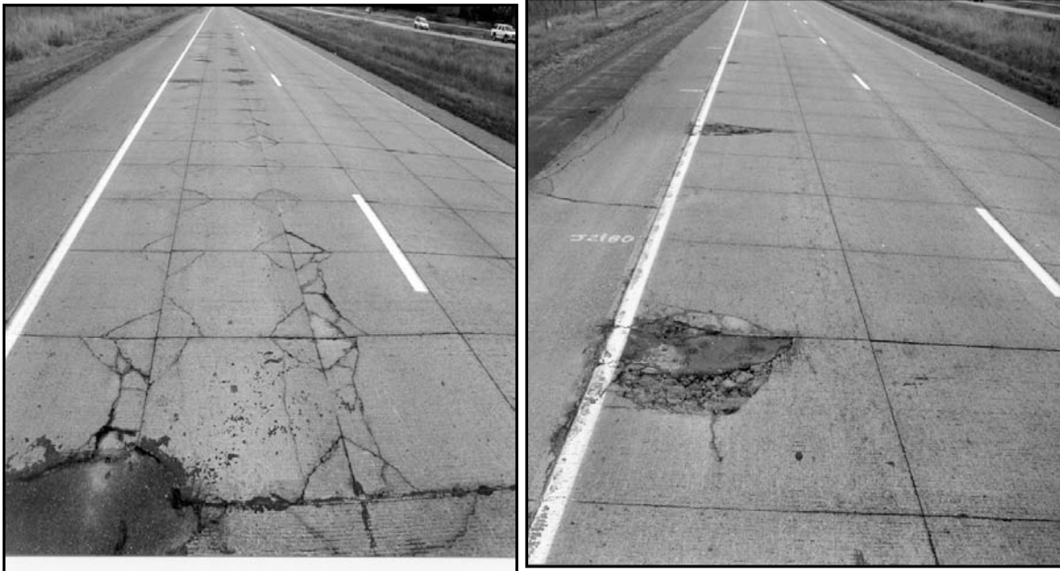
Photos 1 & 2. MnROAD UTW test Cell 94 (left photo) and test Cell 95 (right photo) after 5 million CESALs (November 2003). Driving lane is on left side in photos.

panel sizes and two thicknesses. Test cells 93 and 94, consisting of 4 foot by 4 foot panels, both demonstrated corner cracking in locations near the wheelpaths. The concentration of heavy loads near the edge of the thin panels exceeded their load capacity. Cell 93, with a concrete surface thickness of 4 inches, exhibited approximately 75% less cracks than the 3 inch thick Cell 94. Photo 1 shows the typical crack pattern experienced by Cells 93 and 94.